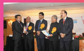
International Corporate Excellence Award, 2011