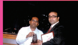
Corporate Social Responsibility Award, 2010