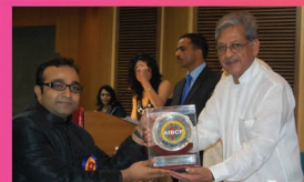
Udyog Bharati Award, 2010