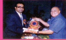
Bhartiya Udyog Ratna Award, 2008