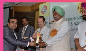
National Healthcare Excellence Award, 2011