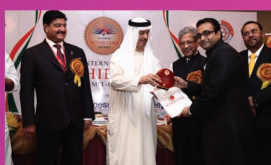
Rashtriya Udyog Ratna Award, 2012