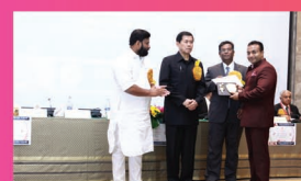
Global Achievers' Award, 2013