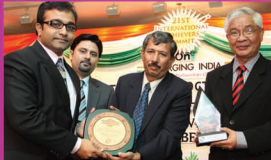
Glory of India Award, 2009