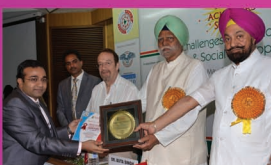
Bharat Gaurav Award, 2011