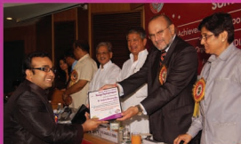
Indian Achievers' Award, 2010