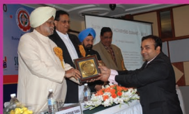
National Quality Excellence Award, 2010