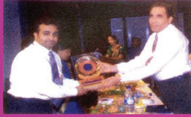
Rashtriya Udyog Pratibha Award, 2008

The company has to its credit the following Awards for its outstanding contributions in the field of Homoeopathy.