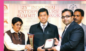
International Achievers' Award, 2010