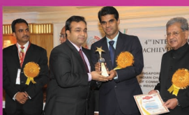
International Quality Excellence Award, 2011